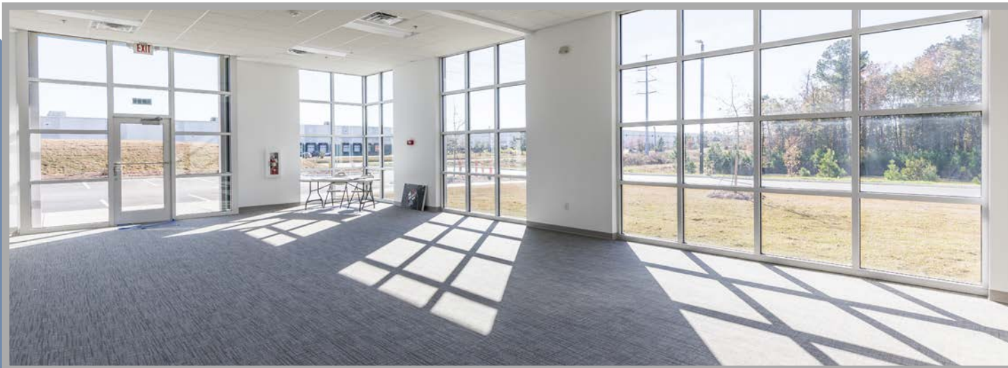
West office entrance