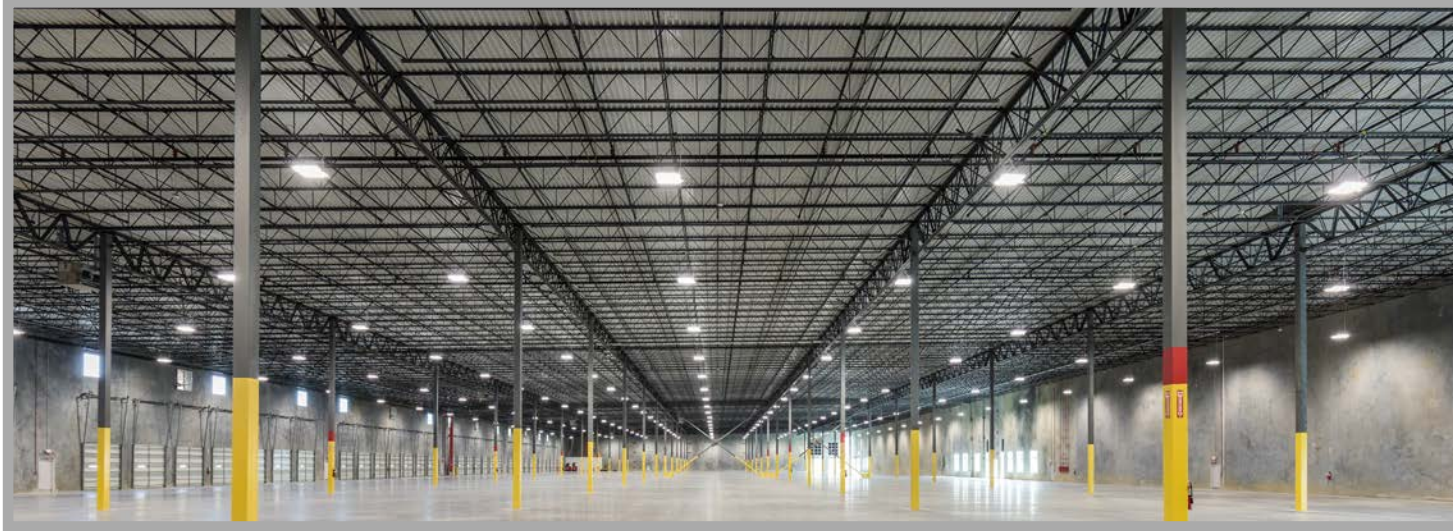
Entrance to Warehouse from office